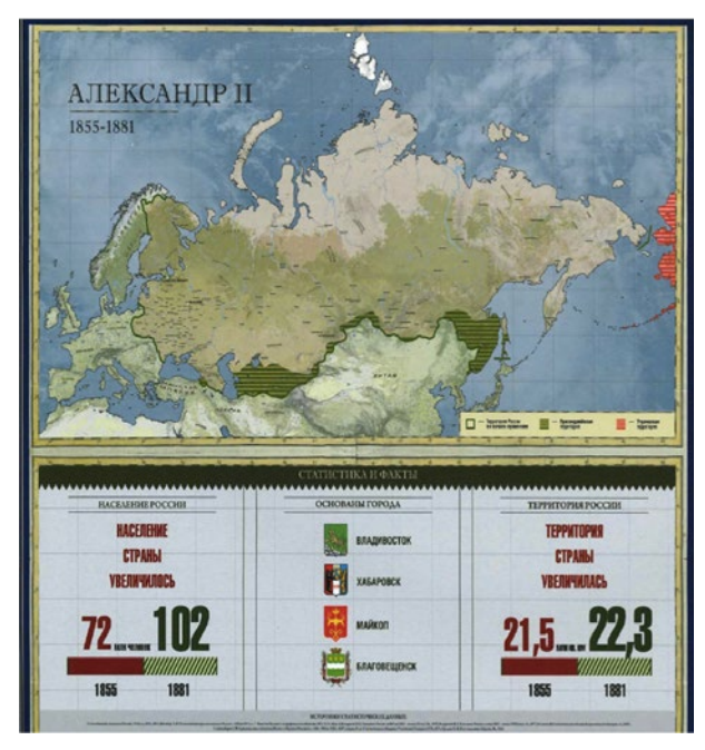
Figure 2. Map of the Russian Empire during the reign of Alexander II (scan from Voz'mi istoriiu s soboi 2017:33)