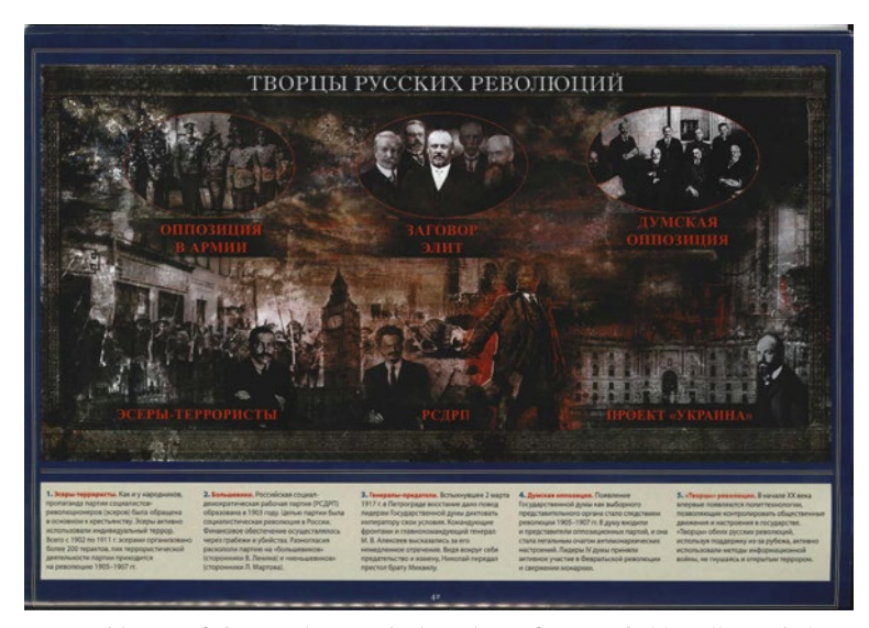
Figure 6. Architects of the Russian revolutions (scan from Voz'mi istoriiu s soboi 2017:42)

an elite plot, opposition in the Duma, socialist revolutionary terrorists, the Russian Social Democratic Labor Party, and project "Ukraine" (an alleged plot to split Ukraine and Russia by unleashing foreign-backed nationalist forces).