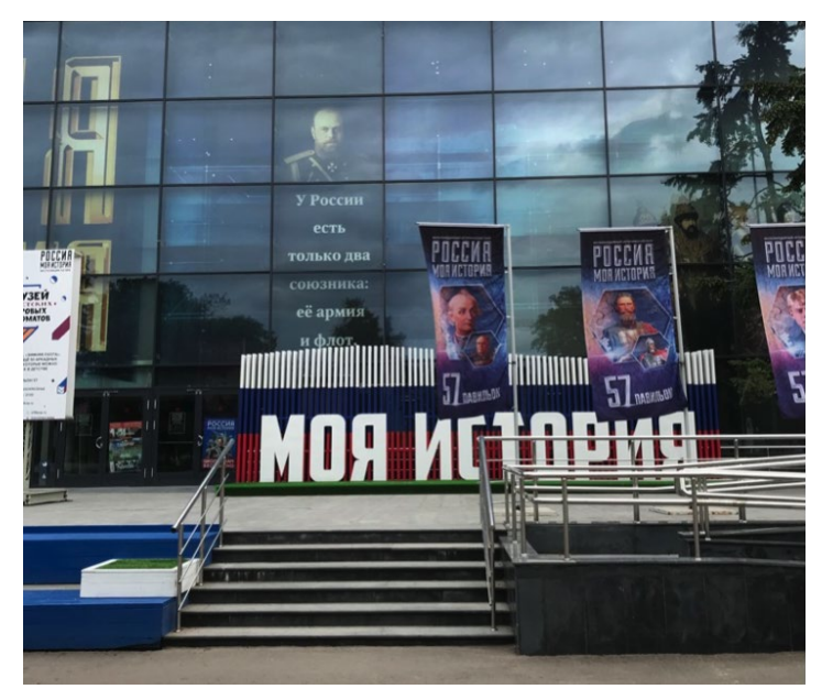
Figure 3. Photograph of the outside of the Russia My History Pavilion, VDNKh, Moscow, showing Alexander III and his quote "Russia has only two allies: her army and her navy"

As I have noted, creating an irredentist view of the past involves some nominal understanding and promotion of a central ethnos. Within the confines of the exhibition and the use of the maps, the focus on population increase presented in green drives to this simple interpretation of a Russia growing in size alongside its population. There is no acknowledgement of the empire's multiracial population; instead the viewer only sees changes in population's size, which implies that it is a single group—an ethic Russian group. As the head of the dynasty, and by extension Russia, each tsar is therefore representative of the Russian ethnicity, unequivocally conflating the empire with the Russian ethnicity. The lands conquered in Siberia, Central Asia, Eastern Europe, and the Caucasus are shown as simply incorporated into the empire, without acknowledgement of their peoples, cultures, or ethnicities. Such a depiction, if left unchallenged, creates an image of the Russian Empire as a monoethnic empire of ethnic Russians. It is a Russo-centric worldview that harkens to a populist, irredentist view of the past. This historical narrative proves conducive to the present, as it mirrors contemporaneous developments within Russia that present the country as an ethnically and culturally homogenous state.