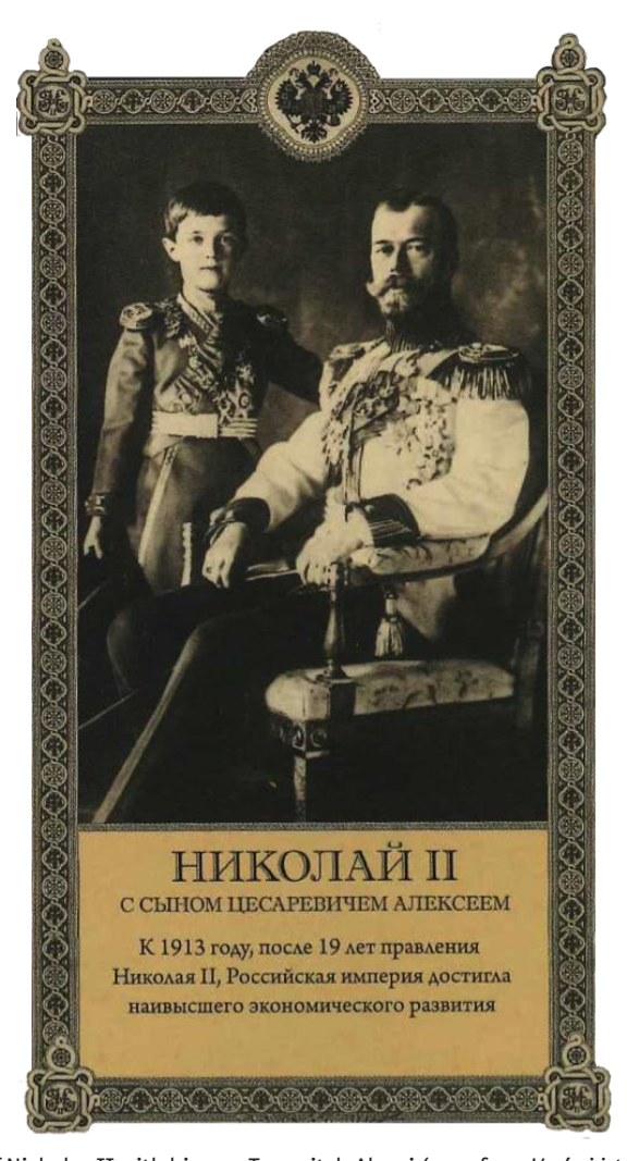
Figure 5. Portrait of Nicholas II with his son, Tsarevitch Alexei (scan from Voz'mi istoriiu s soboi 2017:41)

However, there is an inherent issue with Nicholas's narrative—the Revolution and its role as the foundational myth of the USSR and, by extension, of the modern Russian Federation. It brought about the end of the Romanovs and, with them, of the empire. Despite this complication, the events in Russia after the 1905 Revolution, First World War, and the lead-up to the revolutions of 1917 are not denied at all. Instead, Nicholas is not presented as an active player in the circumstances that brought about the end of the empire. The imagery used on the screens in the exhibit for this revolutionary period is noticeably darker, more dramatic and creates, in keeping with the historic facts, a sense of turmoil and revolt. Yet, Nicholas II is not portrayed as an active figure in this narrative. Instead he is passively mentioned as a mere factual point. The board that presents the "architects of the Russian revolutions" is dark, almost burnt in appearance, with six groups identified as the cause for the Revolution: opposition in the army,