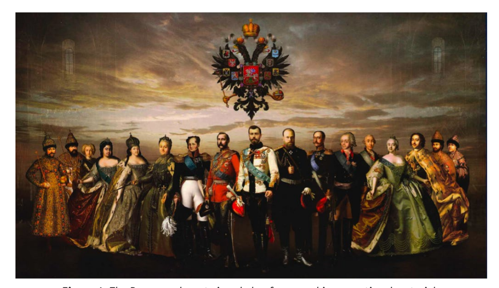
Figure 4. The Romanov dynasty in echelon form, used in promotional materials

against the background of a brooding sky (see figure 4). Such an image does two things for our interpretation of the Romanov's: First, it portrays each tsar as a distinct actor within the dynasty in an almost soap opera—like configuration; it presents the Romanov dynasty as an ensemble cast who represent the dynasty as a whole. Secondly, it shows each member of the dynasty as open for re-evaluation and reconceptualization. Hence, we are able to identify a second important motif of this exhibit. The reformation of the Romanov constellation injects new life into the Russian pantheon of heroes. By restructuring this heroic lexicon, those aligned with the Putinist regime rehabilitate a Russian historical identity better suited to their objectives.