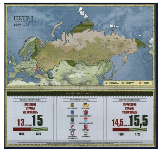
Figure 1. Map of the Russian Empire during the reign of Peter I