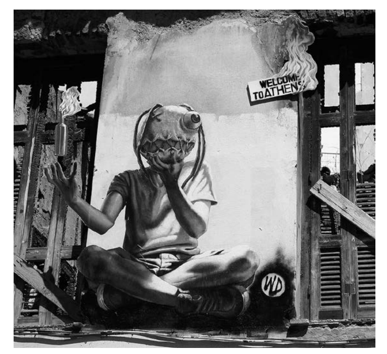
Figure 2. Welcome to Athens, by WD, 2012.

Since this article engages with the multiple stories "tagged" on the Athenian social fabric, the best way to introduce readers to the city is through a street art piece. The analysis here follows the premises of visual sociology in which, as Caroline Knowles suggests, "photographs are eminently significant social texts. They depict elements of the social fabric for skilled interpretation and are hence to be seen as a resource in the task of social analysis" (2000:21). In other words, the analysis moves away from purely logo-centric arguments by engaging with the images of street art pieces and treating them as relevant social data.