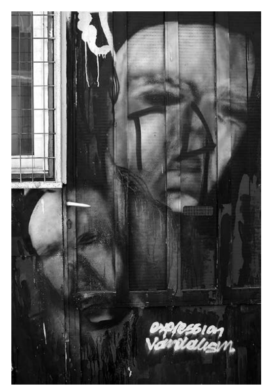
Figure 4. Expression Vandalism, by Pete, 2012.

As demonstrated in the images and extracts of interviews alongside my analysis of the political street art scene in Athens of recent years, if these walls could talk, they would narrate counterhegemonic stories from the margins of cultural production. This terrain of subversive cultural production and alternative subjectivities is of utmost importance, especially in this era of crisis and aggressive neoliberalism. The battle over space is of strategic relevance—not only over public space but also space for different expressions of culture, space for new meetings and imaginings, in short, a space for resistance. In this light, street art offers an opportunity for a collective reflection on the imaginary domination of capitalism, or as Chantal Mouffe puts it, "artistic and cultural practices can offer spaces for resistance that undermine the social imaginary necessary for capitalist reproduction" (2013:88). In a similar line of thought, Antonio Gramsci ([1959] 1989) asserted that capitalism maintains control not only through political and economic coercion but through ideology. It is in the ideological terrain that capitalism, as famously stated, leaves "no alternative."<sup>26</sup> Political street art, then, not only tags ways of subversive imagining on the walls but, most importantly, directly challenges the inevitability of capitalist ideology.