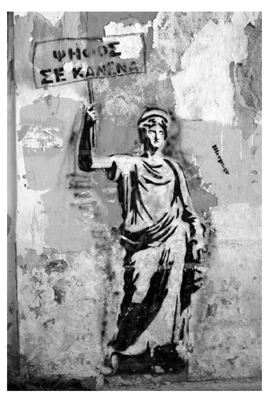
Figure 3. Vote for No One, by Bleeps.gr, 2010.

In interviews the artists explained their practice of this new form of mass communication as follows: "Images speak louder than words, and if we use words, we make sure that they are in English so everyone can understand.... We want to create a new visual vocabulary."<sup>19</sup> By contrast, an artist working with stencils said: "I use reversed propaganda in my work. I want to change the meaning of specific symbols, create a new dictionary. A new way of communication. It's a political act. You start from the realization that you don't like what surrounds you. You don't like what you've been served."<sup>20</sup> Street artists refine and define the communicative tools of social discourse by subverting symbols and exploiting recognizable images.